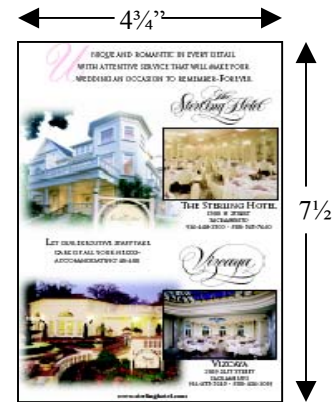
Full Page - $500