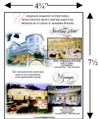
Full Page - $500