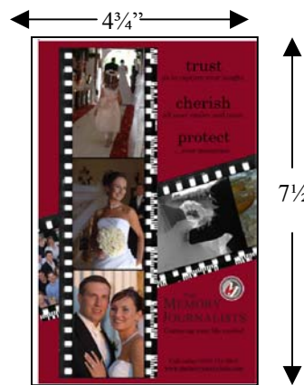
Full Page - $500